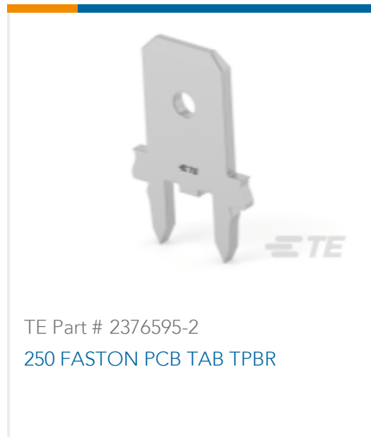
TE Part # 2376595-2 250 FASTON PCB TAB TPBR