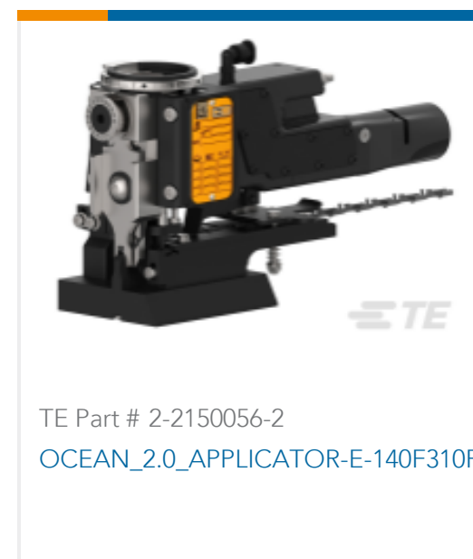
TE Part # 2-2150056-2 OCEAN_2.0_APPLICATOR-E-140F310F