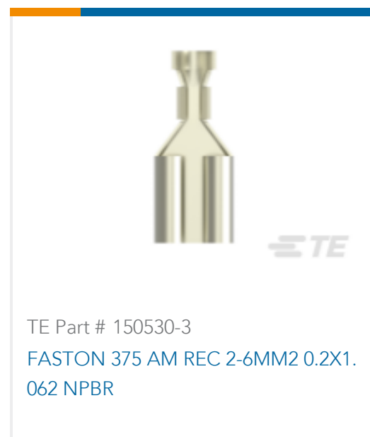
TE Part # 150530-3 FASTON 375 AM REC 2-6MM2 0.2X1.062 NPBR