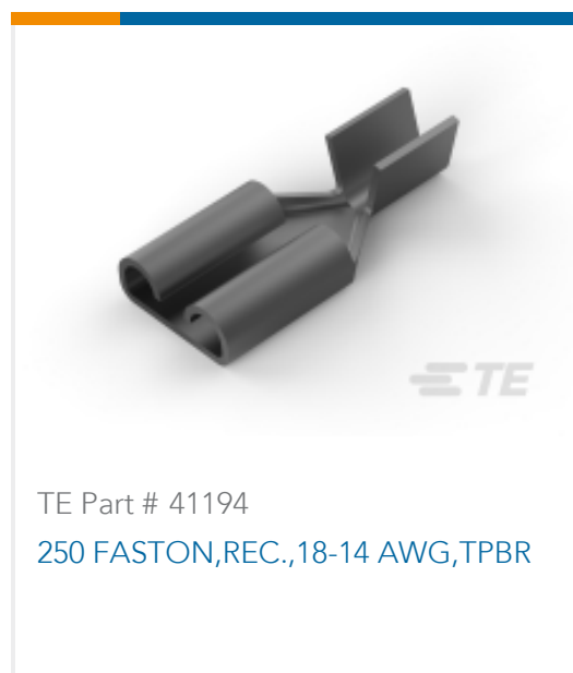
TE Part # 41194 250 FASTON, REC., 18-14 AWG, TPBR