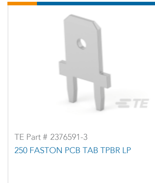
TE Part # 2376591-3 250 FASTON PCB TAB TPBR LP