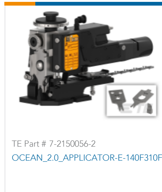
TE Part # 7-2150056-2 OCEAN_2.0_APPLICATOR-E-140F310F