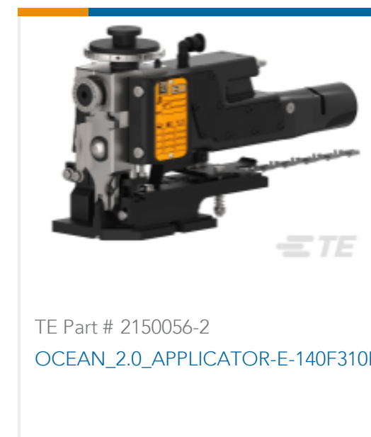
TE Part # 2150056-2 OCEAN_2.0_APPLICATOR-E-140F310F