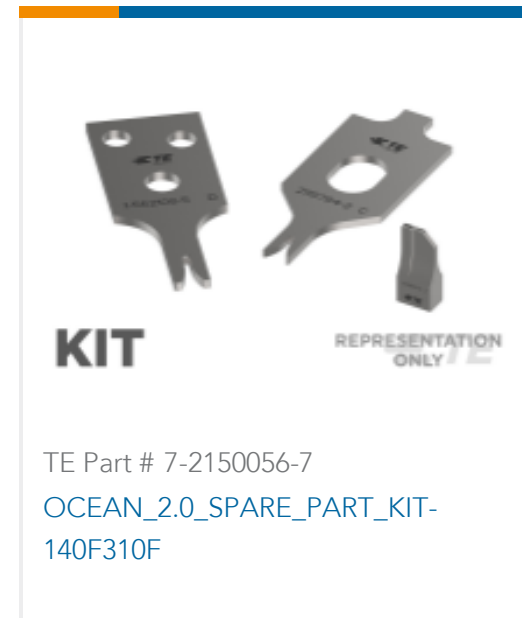
TE Part # 7-2150056-7 OCEAN_2.0_SPARE_PART_KIT-140F310F